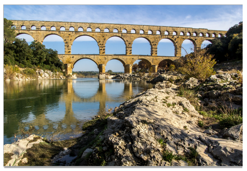
The Pont-du-Gard aqueduct. Built in the 1st century AD.

When I'm asked of an example of a well-designed API, I usually show a picture of a Roman aqueduct: