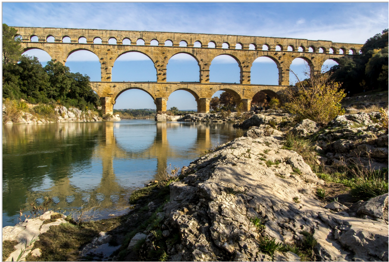
The Pont-du-Gard aqueduct. Built in the 1st century AD

When I'm asked for an example of a well-designed API, I usually show a picture of a Roman aqueduct: