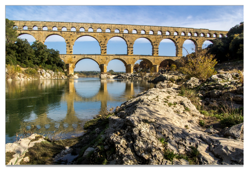
The Pont-du-Gard aqueduct. Built in the 1st century AD

When I'm asked for an example of a well-designed API, I usually show a picture of a Roman aqueduct: